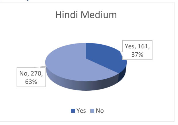
FIGURE 4 DISTRIBUTION OF LEVELS OF STRESS AMONG THE STUDY SUBJECTS. (N=431)